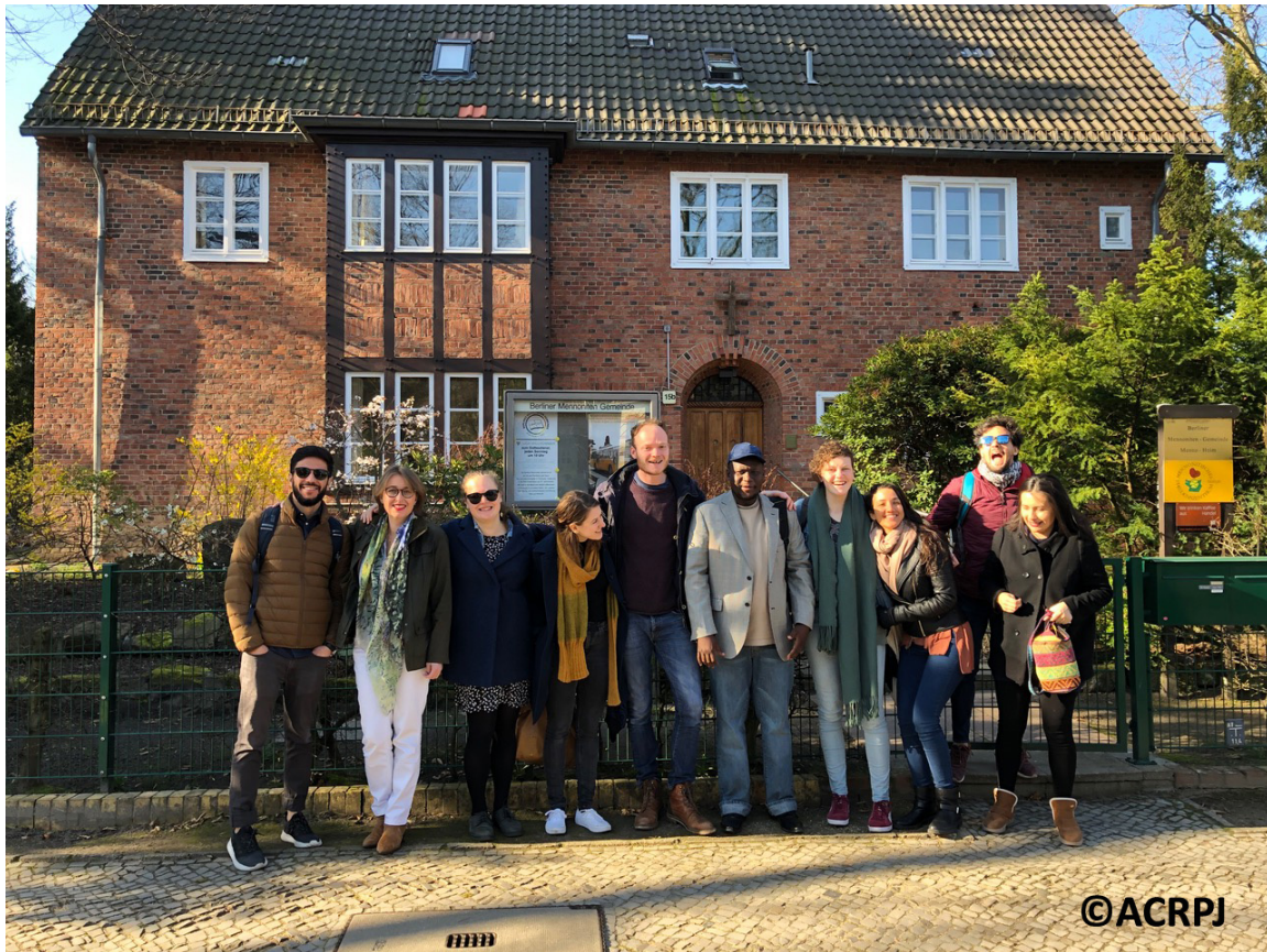
Excursion group of PTR-students at Menno-Heim, Berlin, Germany