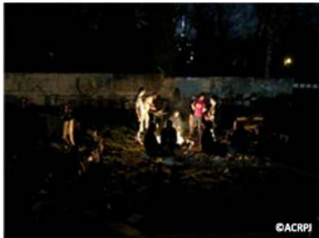
From left to right: Garden behind the new Chapel of Reconciliation, the former Wall, called Niemandsland . Now flourishing in the sun. BBQ in Niemandsland .

At the same time, it was for me an experience of transformation, sitting in the flourishing garden of the chapel, built on the grounds of a former church, at the former death-zone, in Niemandsland , having a BBQ in freedom and with friends. This sign of transformation may be a sign of hope and resurrection, first of all for the people in Germany, still looking for overcoming division and their common identity, and secondly for all of us, people who don't expect hope, transformation or a new life. It is possible!