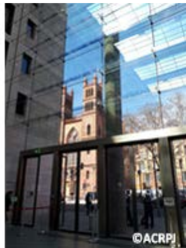
Entrance Hall of the Ministry of Foreign Affairs. Sight from inside to outside at the entrance hall of the Ministry of Foreign Affairs.