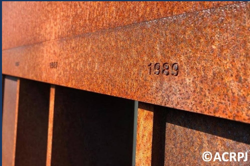
Window of Remembrance – Berlin Wall Memorial