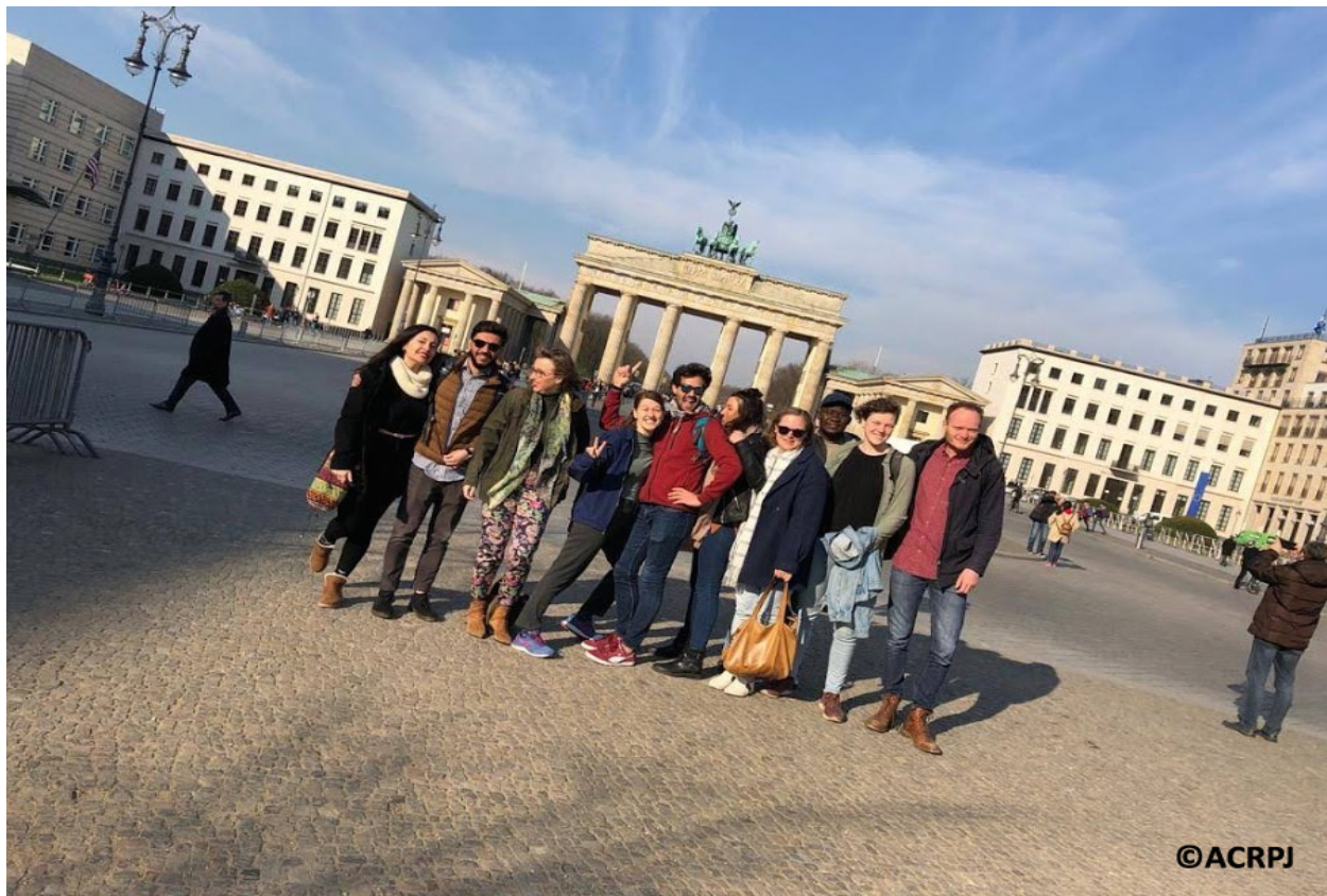
Excursion group of PTR-students at Brandenburger Tor, Berlin, Germany